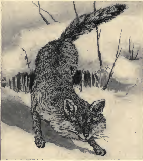
FIG. XLVIII. UROCYON C. FRATERCULUS . LITTLE GRAY FOX.